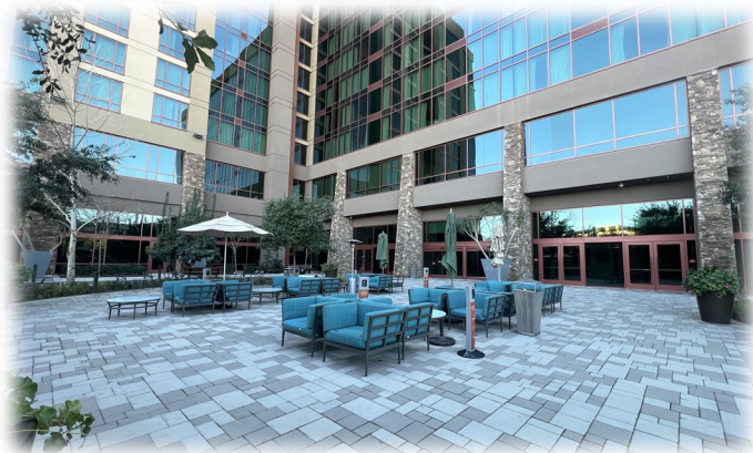
East Plaza is located outside the Resort Tower near the Summit Meeting Rooms.