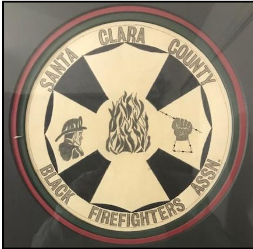
Photo of the original logo for the Santa Clara County Black Firefighters Association