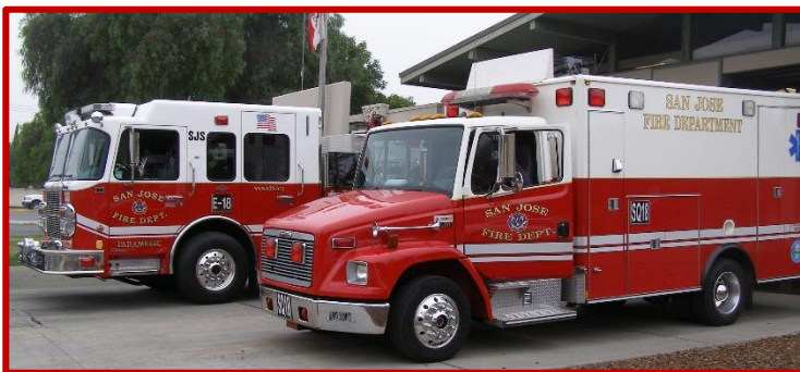
View from front of Station #18

View from street showing Valley Christian High on far hill.